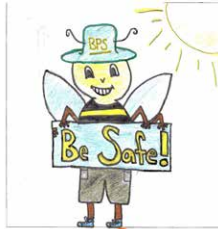
Designed by Tolotea