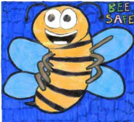
Designed by Charli

Your designs will be used as inspiration for our final designs.